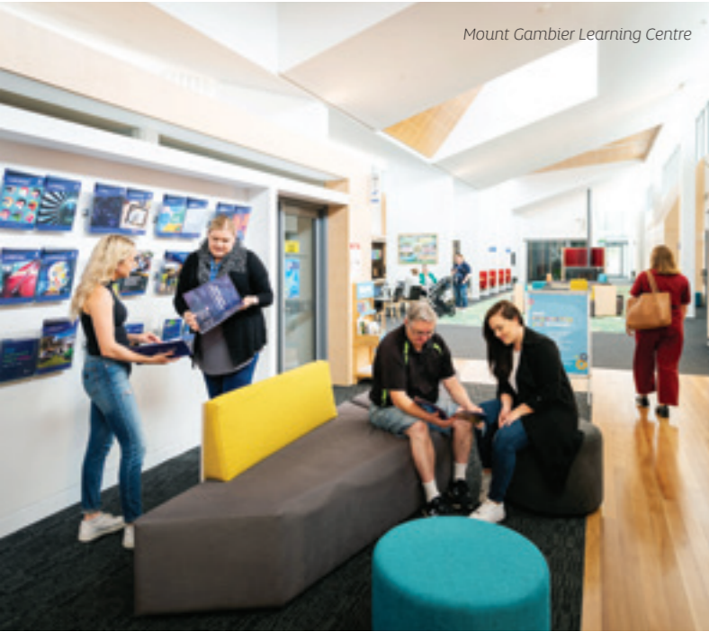
Mount Gambier Learning Centre