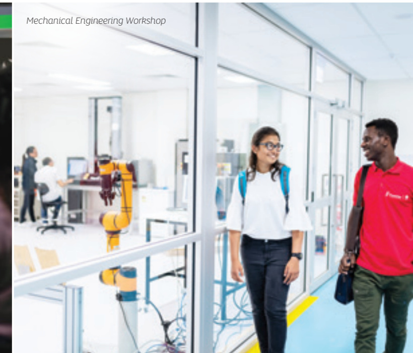
Mechanical Engineering Workshop