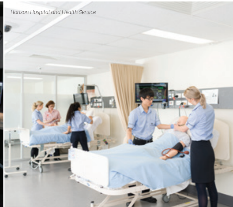
Horizon Hospital and Health Service