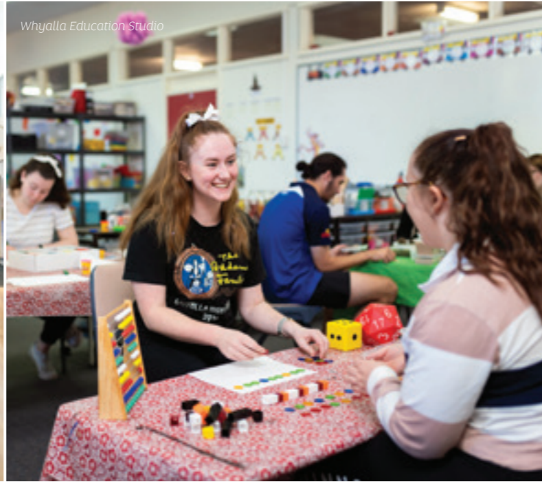
Whyalla Education Studio